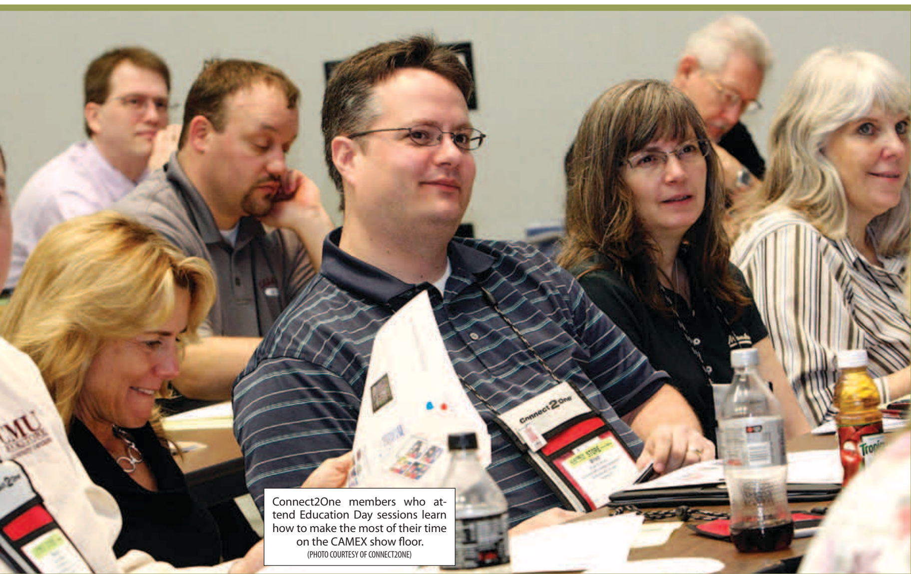
Connect2One members who attend Education Day sessions learn how to make the most of their time on the CAMEX show floor.