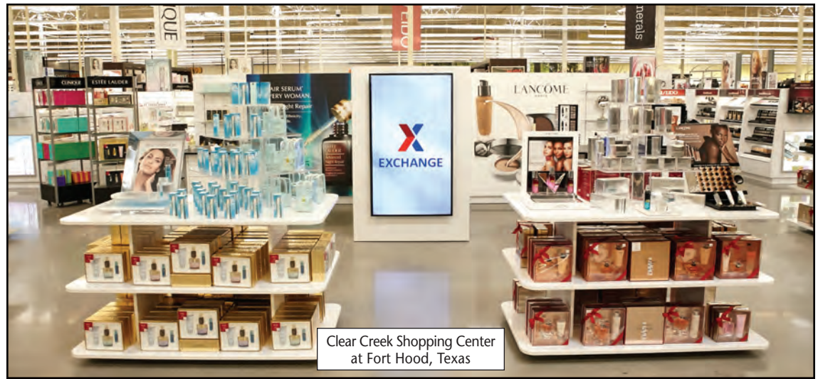
Clear Creek Shopping Center at Fort Hood, Texas