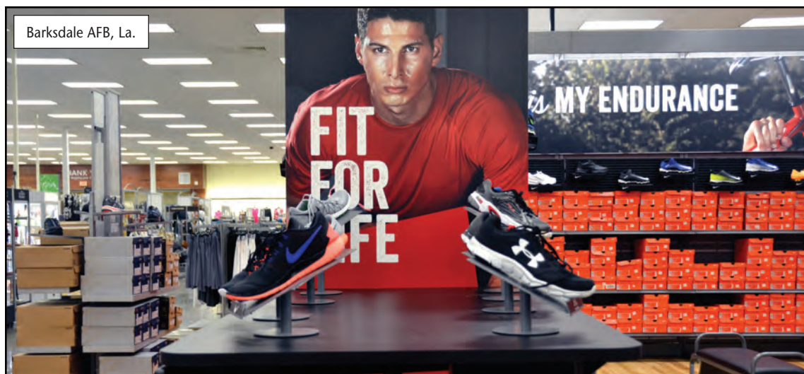
Barksdale AFB, La.