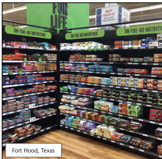
Fort Hood, Texas