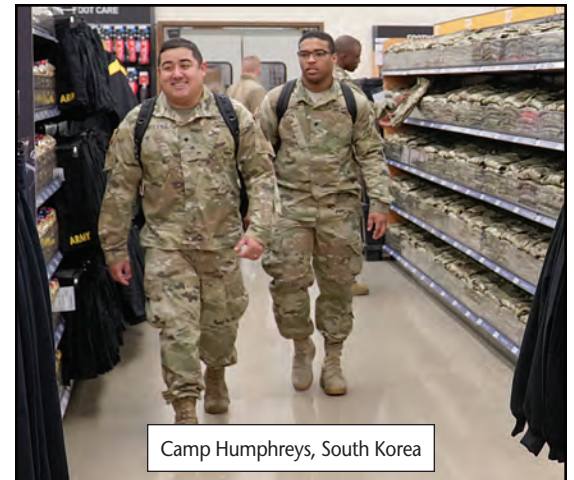
Camp Humphreys, South Korea