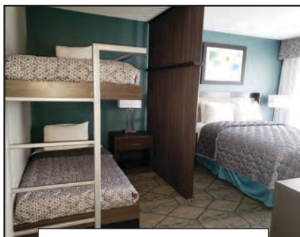
Navy Lodge North Island, Calif.